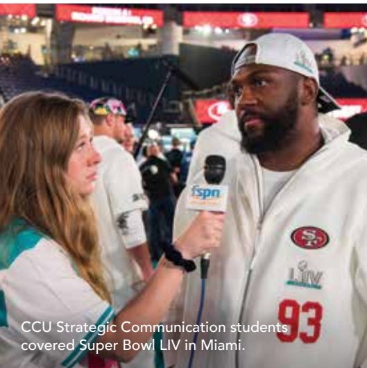
CCU Strategic Communication students covered Super Bowl LIV in Miami.