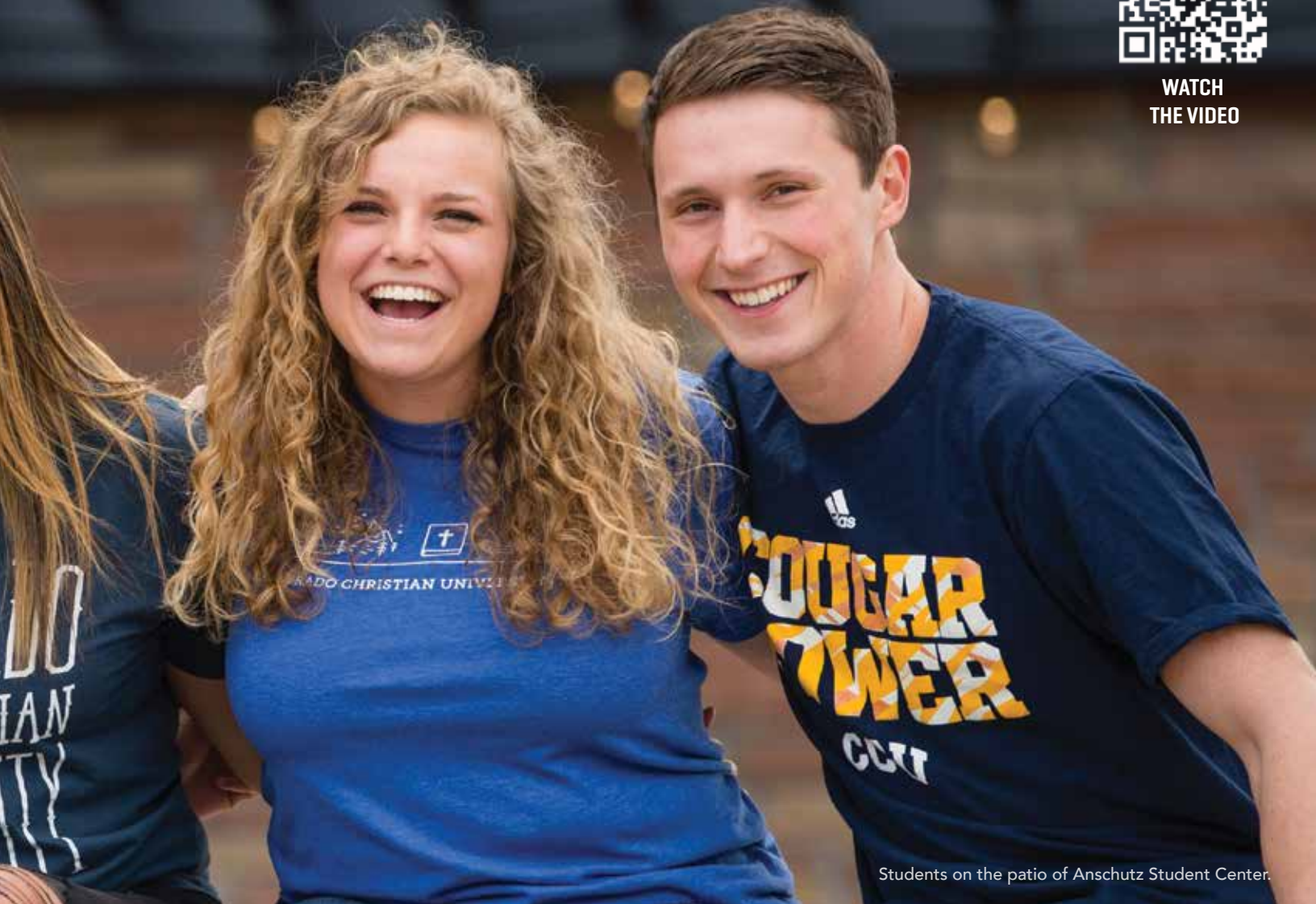
Students on the patio of Anschutz Student Center.

Grace and truth. For us, that means real life, real faith. We are a generation that is looking for something real. We want to know others, and we want to be known. What matters is relationships, grace, and being equipped with the truth to prepare for the challenges ahead. We're not here for merely books and lectures. We are here for wisdom, life-changing conversations, and connections — with each other and with the living God.