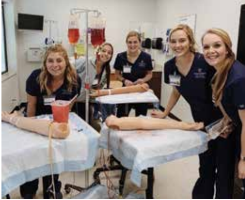
♡ 👍 📌 Hit us up if you need an IV 🩺 blessed to be in nursing school with these girls