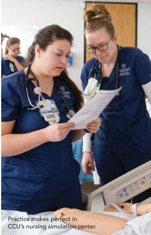
Practice makes perfect in CCU's nursing simulation center.