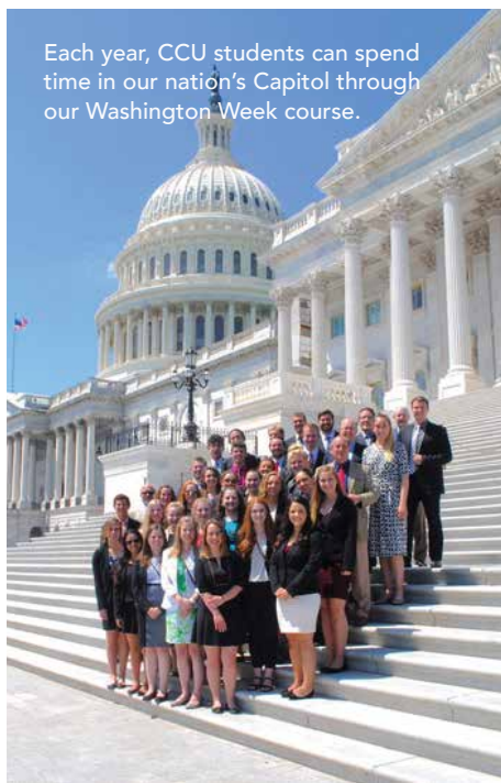
Each year, CCU students can spend time in our nation's Capitol through our Washington Week course.

Finally, the study of Politics at Colorado Christian University deliberately combines philosophic breadth and theological insight with practical relevance. Students explore human nature and ethics along with political and economic power and history.