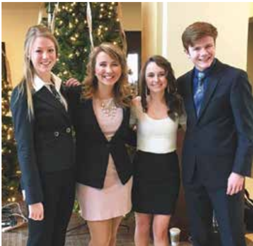
♡ 👍 📌 WE'RE DONE! 200 point business plan presentation is in the bag! so thankful for such a good team and a great semester of business 101! #CCUSchoolofBusiness