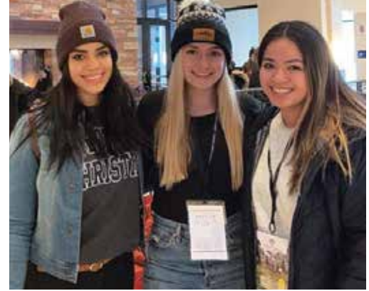
♡ 👍 📌 a sweet friendship refreshes the soul ❤️