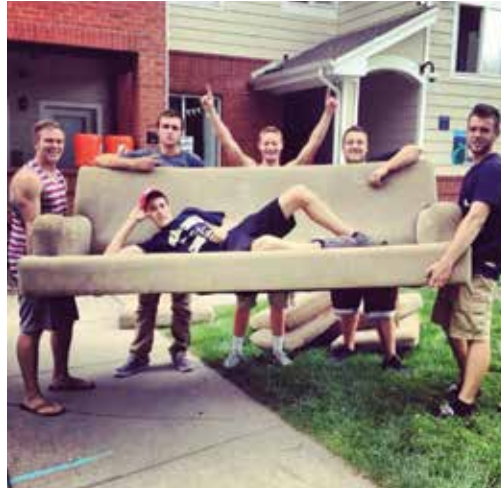
♡ 👍 📌 Freshmen ready to embark on a new school year at #CCU #Lakewood #Denver #couch #boys