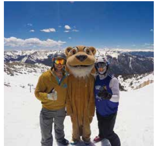
♡ 👍 📌 With the perk of only living an hour away from the mountains, head up this weekend to catch the fresh pow #noschoolonfridays #cougarscanshredtoo