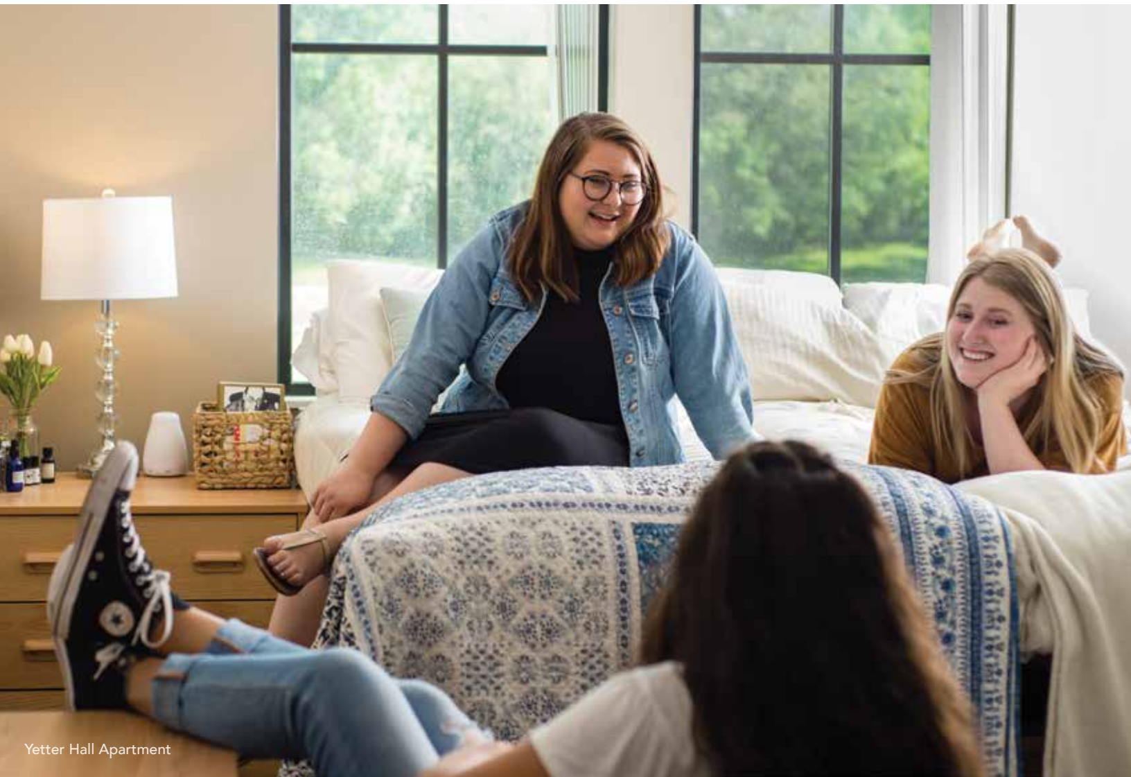
Yetter Hall Apartment