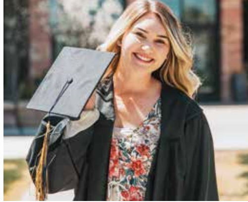
♡ 👍 📌 19 days