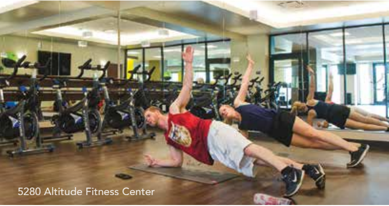
5280 Altitude Fitness Center