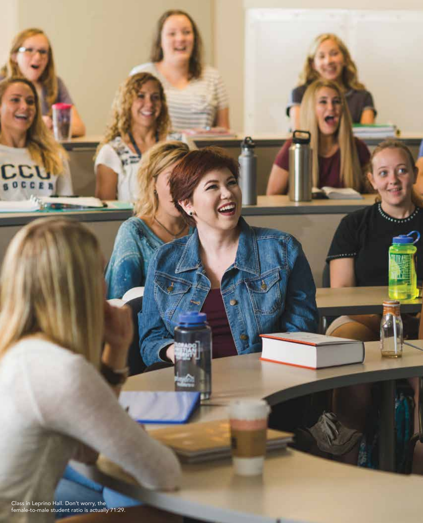
Class in Leprino Hall. Don't worry, the female-to-male student ratio is actually 71:29.