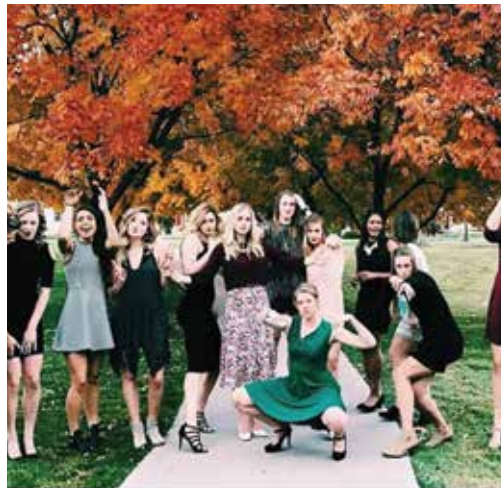
♡ 👍 📌 trying to figure out what it means to grow up & I'm missing these sweet moments a little extra today