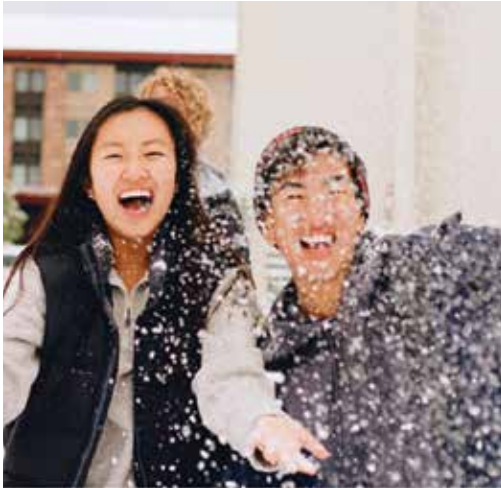
♡ 👍 📌 don't let the smile fool you - i hate the cold.