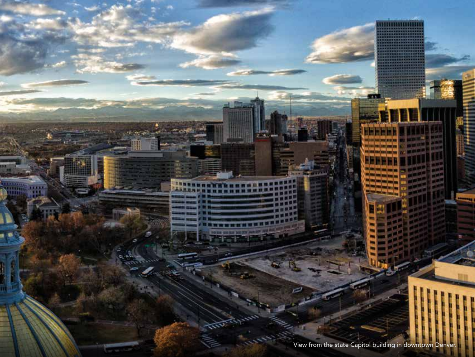
View from the state Capitol building in downtown Denver.