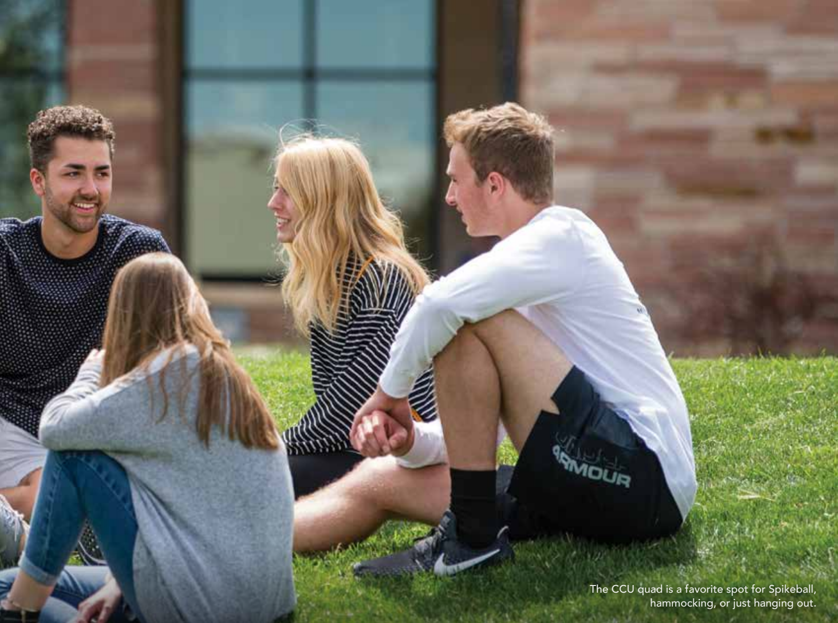
The CCU quad is a favorite spot for Spikeball, hammocking, or just hanging out.

At the heart of our unique campus community lies the deep Christian commitment of our students, faculty, and staff. We are passionate about growing you spiritually as well as intellectually. Our aim is to promote academic excellence and professional competence, coupled with strengthening your Christian faith — because we believe everything depends on it.