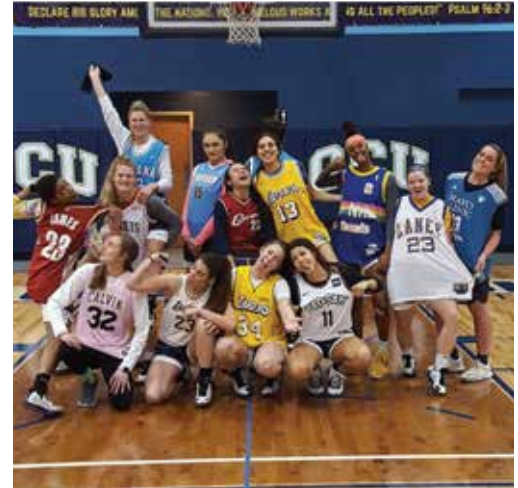
♡ 👍 📌 We got next...#GoCougsGo